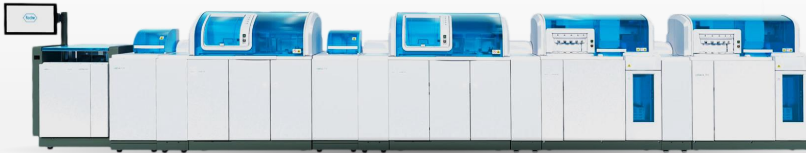
cobas ® pro integrated solutions