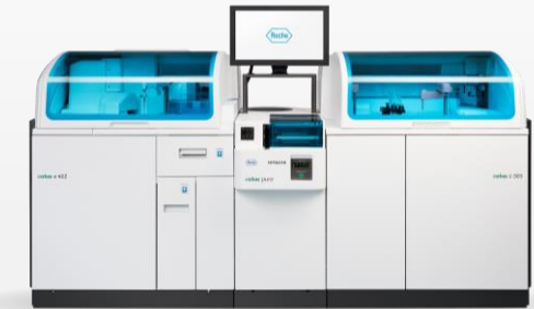
cobas ® pure integrated solutions*